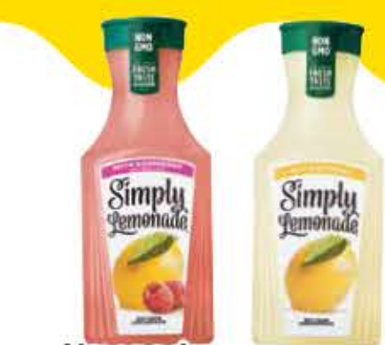
Limonada Simply Lemonade Selected Varieties 52 oz.