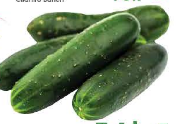
Pepino Grande Large Cucumber