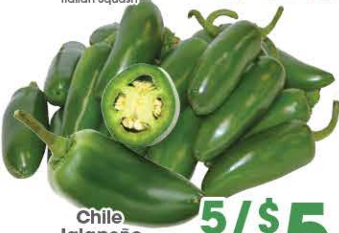
Chile Jalapeño Jalapeño Peppers