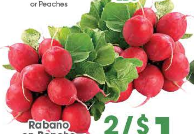
Rabano en Bónche Radish Bunch