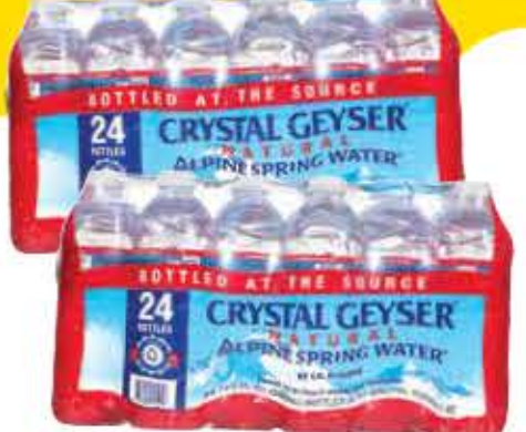
Agua Crystal Geyser Drinking Water 24 Pack, .5 Liter Bottles