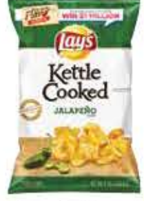
Botanas Lay's o Kettle Chips Selected Varieties Potato Chips, 7.75-8 oz.