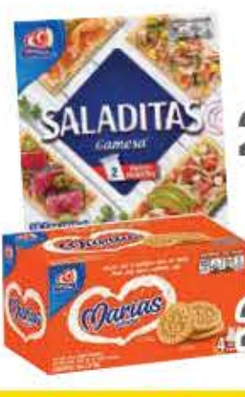
Galletas Gamesa Saladitas Saltine Crackers 14.7 oz.