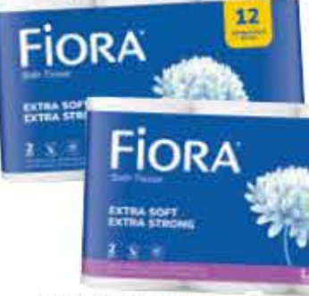
Papel Higienico Flora Selected Varieties Bath Tissues, 12 ct.