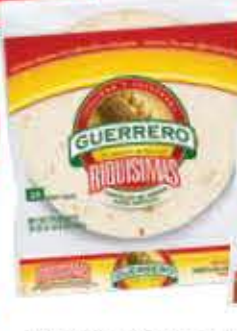
Tortillas de Harina Riuisimas o Triguenas Guerrero Flour or Wheat Whole Tortillas 24 ct.