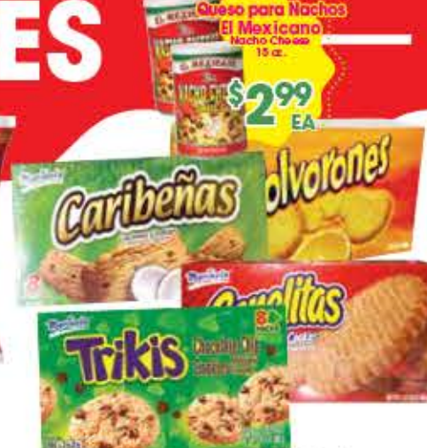
Marinela Canelitas, Polvorones, Trikis, Gansito Cookies o Caribeñas Selected Pastries, 14.11-20.88 oz.