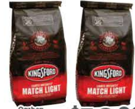
Carbon Kingsford Match Light Instant Charcoal Briquets, 12 lb.