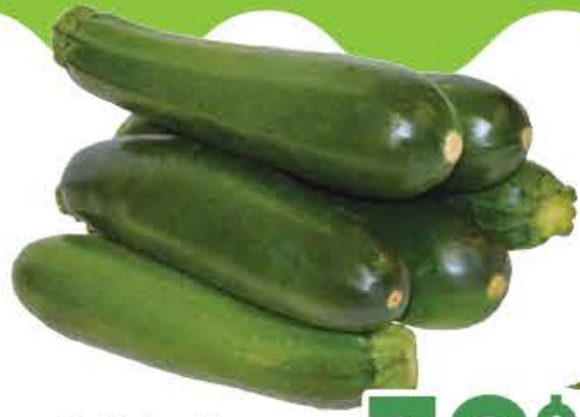
Calabacita Italiana Italian Squash