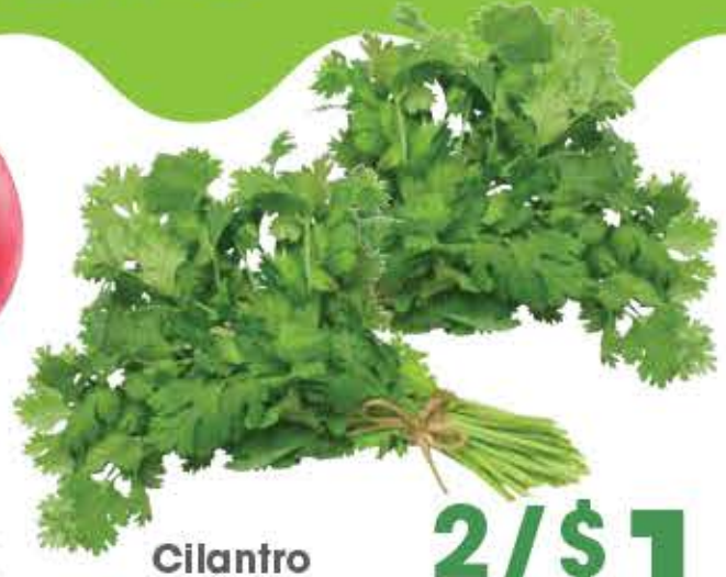
Cilantro en Manojó Cilantro Bunch