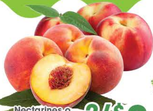
Nectarines o Durazno Amarillo Yellow Nectarines or Peaches