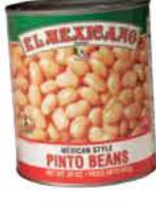
Frijol Pinto El Mexicano Pinto Beans 29 oz.