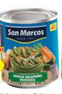
Jalapeños Enteros San Marcos Whole Jalapeños 26 oz.