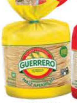
Guerrero Tortillas de Maiz Blancas o Amarillas White or Yellow Corn Tortillas 80 ct.