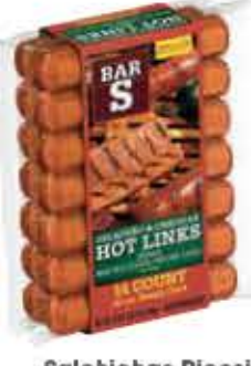
Salchichas Picositas Bar S Selected Varieties Hot Links, 42-48 oz.