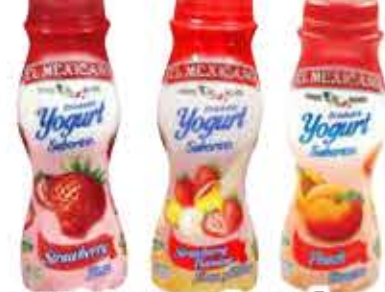
Yogur Bebible El Mexicano Selected Varieties Drinkable Yogurt, 7 oz.