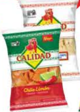
Totopos de Maiz Calidad Chile Limon, Restaurant Style, Yellow or White Corn Tortilla Chips 10.5-11 oz.