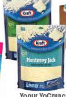
Yogur YoCrunch o Queso Kraft Selected Varieties, Yogurt, 4 Pack Selected Varieties, Cheese, 8 oz.