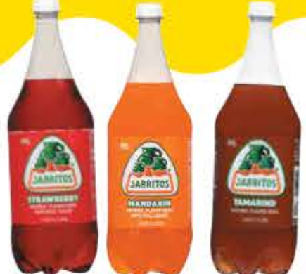
Refrescos Jarritos Selected Varieties Soft Drinks, 1.5 Liter