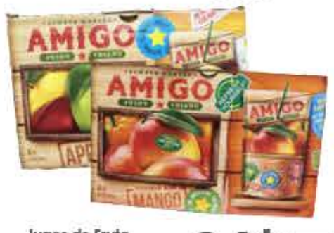
Jugos de Fruta Amigo Selected Varieties Fruit Drink, 6 Pack