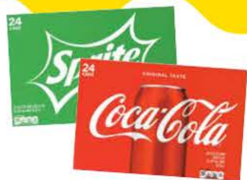
Refrescos Coca Cola Selected Varieties Soft Drinks, 24 Pack, 12 oz. Cans