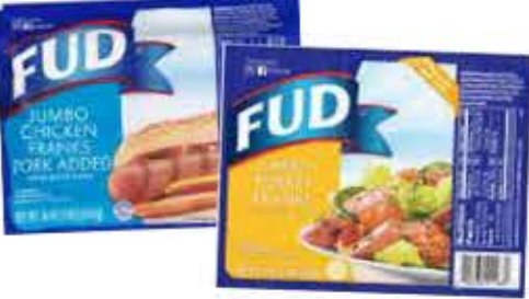
Salchichas Jumbo FUD Selected Varieties Jumbo Franks, 16 oz.