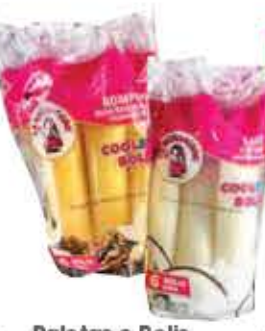
Paletas o Bolis La Michoacana Ice Slick or Pops Selected Varieties, 6 ct.